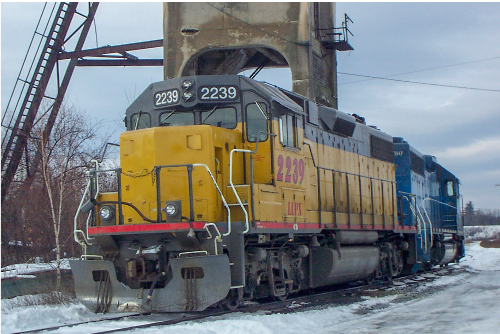
January 1, 2003 – LLPX 2239 and LLPX 2260 underneath the coal tower at Northern Maine Junction