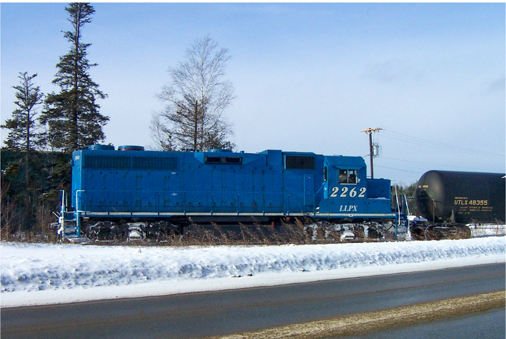
2262 was the Searsport Local on January 8, 2003 – shown here crossing Coldbrook Road in Hermon, Southbound