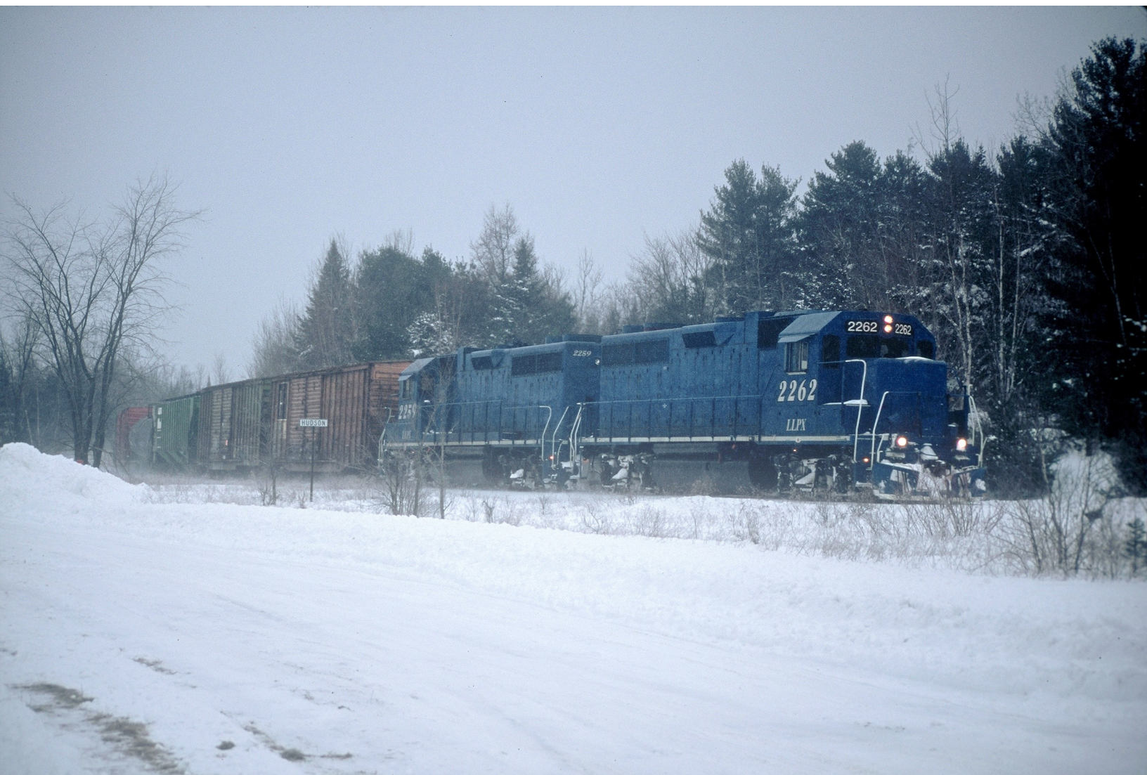
January 8, 2003 – 2262 and 2259 Southbound in Hudson, Maine for the last time under the Bangor and Aroostook Railroad name