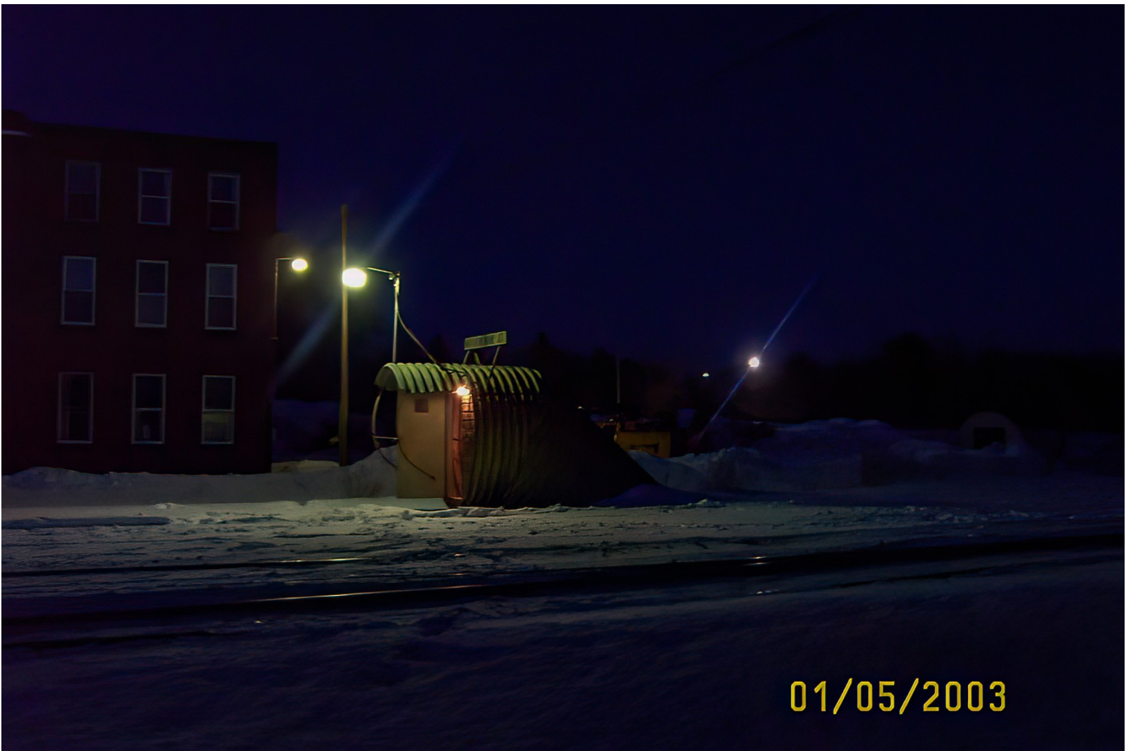
Evening of January 5 th , 2003 – the 'Tube' under the old Maine Central main line.