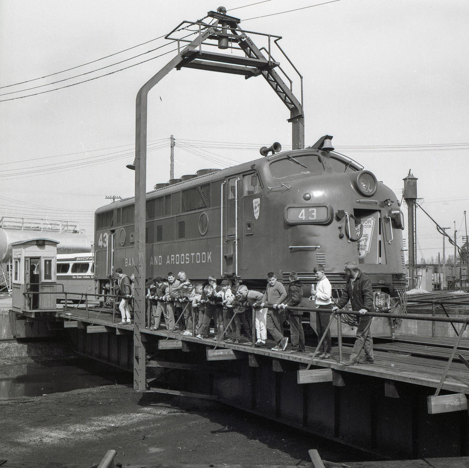
Above: 43 on the turntable at Northern Maine Junction