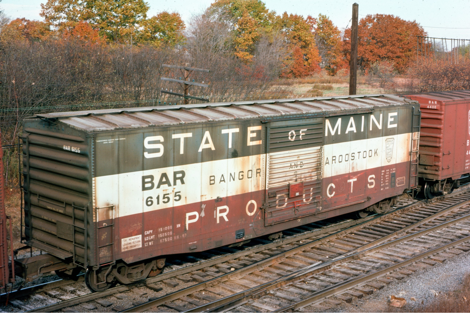
Above: 6155 in Rigby Yard, South Portland, Maine – October 25, 1974.

Theory number two: In 1937 the ICC stepped in. Rule 201 regulated the size of letters on the side of boxcars. It regulated what railroad owned equipment could have on the sides and forbid discounts to a company that put an ad on the railroad's car. The law allowed private companies to paint their cars with logos or ads as long as they conformed to the standard reporting marks and weight carrying rules. The BAR shipped hundreds of thousands of pounds of potatoes each year. But the railroad provided the cars – meaning the railroad owned them. Why would farmers buy a box car and paint it with their farm name? Worse yet, what would the privately owned boxcar do once the harvest was done. Sit for months?