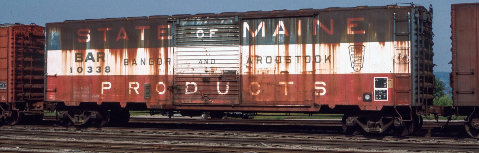
Above: 10338, rust streaks and all, in Searsport Maine, August 3, 1988