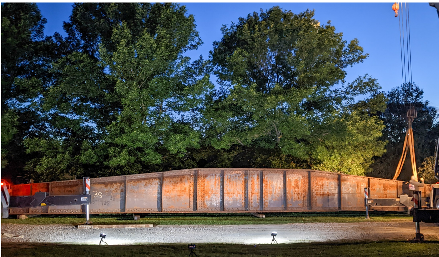
Below: TOUCHDOWN! Ready for restoration, the turntable rests in Unity