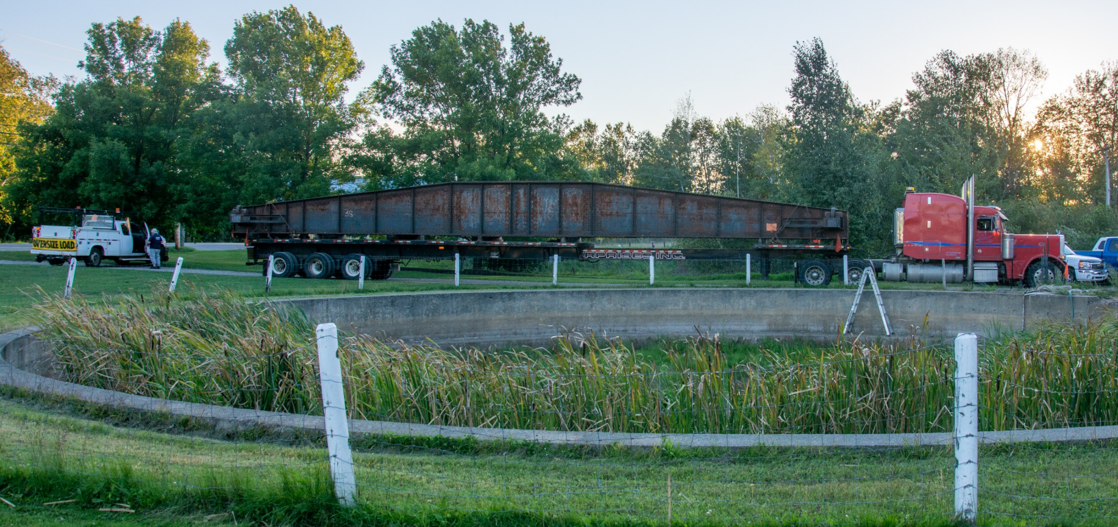
Above: Arrival at Unity, next to the pit that it will eventually occupy