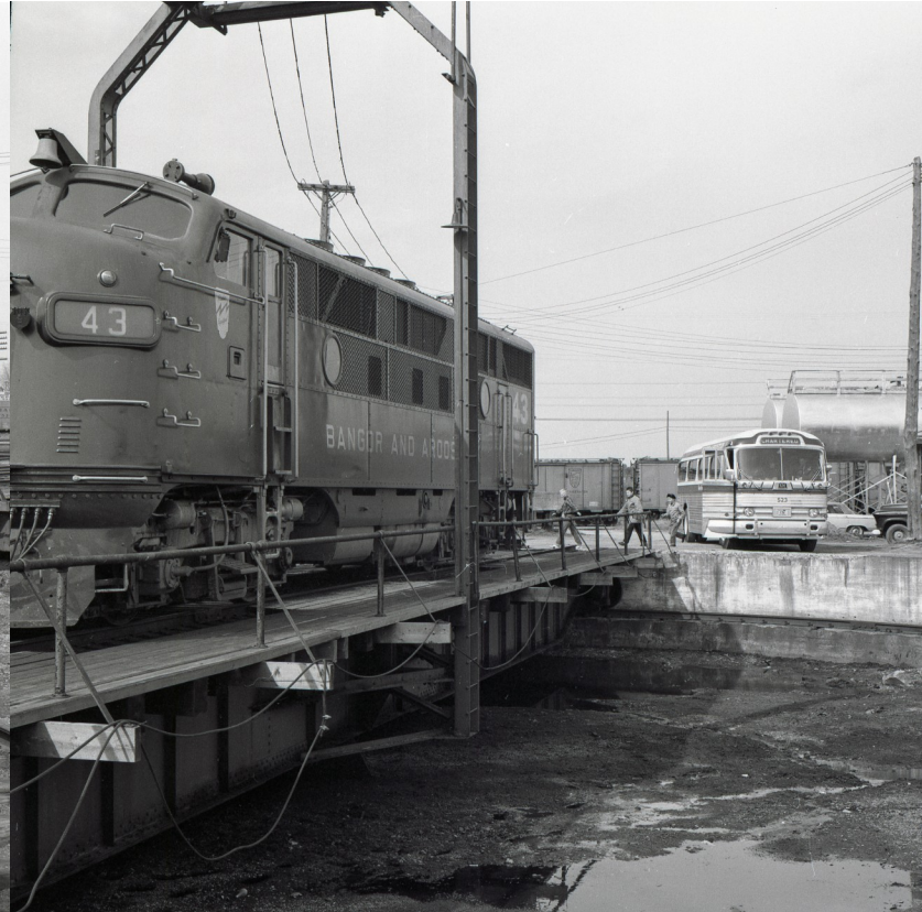
Above: Two views of 43 and the unidentified group at Northern Maine Junction

Editor's Note: In the process of trying to identify locations, people and dates for the various photographs in the B&A's marketing department collection, some photos have proved more difficult than others. A series of four photos (two above, one on the previous page and one on the back cover of this issue) from the collection all seem to feature the same group of children (all boys it appears) at Northern Maine Junction – arriving on a Bangor and Aroostook bus. Aside from bus 523, locomotive 43 and trackmobile X-131, no other equipment is identifiable. A reasonable guess is that this was a Boy Scout troop taking a tour of Northern Maine Junction. However, attempts to identify the individuals have come to nil. In the spirit of historical fiction writing, the children of Player Development were given the photos and told to research what they could about the locomotive, bus, equipment and then use that information to tell the story that the photographs were documenting. The story you are about to read has, probably, very little to do with the reality but is rather entertaining. If you recognize yourself or the events in the photos and would care to identify what was really going on, it would be lovely to hear from you. -JTK