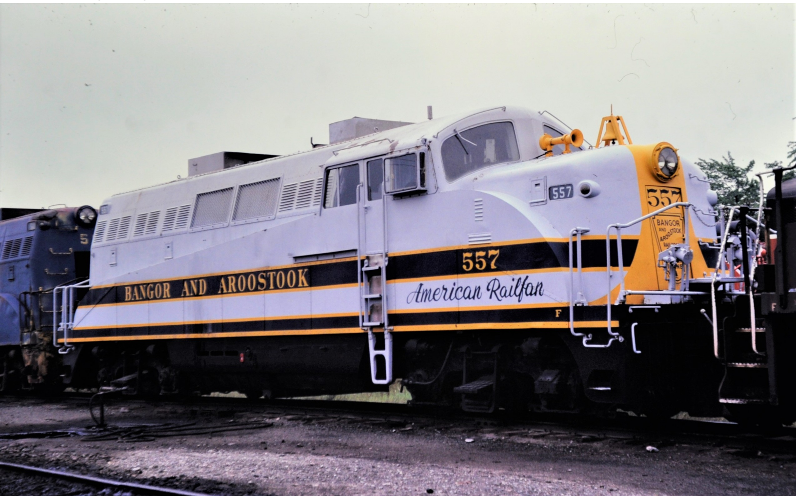
Above: Still proudly wearing her American Railfan name and paint, 557 was in the yard at Northern Maine Junction during Roger Pinta's visit in 1983

In 1947 and 1948 Bangor and Aroostook had purchased eight EMD F3As. Five were still on the BAR roster in 1983. In 1949, the Bangor and Aroostook acquired eight BL 2s. They were numbered 550 to 557 and later changed to 50 to 57. One BL 1 and 58 BL2s were built by General Motors Electro-Motive Division (EMD) between 1947 and 1949. The BL 2 was not very popular. The car hood design was ok for main line and long hauls but not for switching. The BL 2 had a longer high snout. It was even harder to see over.