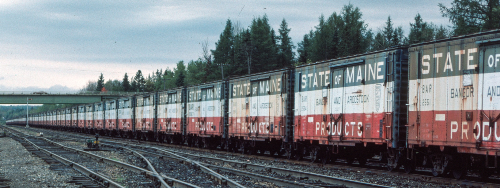
Above: George Melvin shot this VERY long line of State of Maine Products cars in Oakfield, September, 1976.

We found a model of a wooden boxcar labeled potatoes and numbered 61572. We found an N scale car 61585 that had both the potato and railroad on it. We found an HO scale car that had already dropped the word railroad but still said potatoes! We also noticed some of the models replaced the word “and” with the “&.” The print font also varied from manufacturer to manufacturer. Thus, not a reliable source.