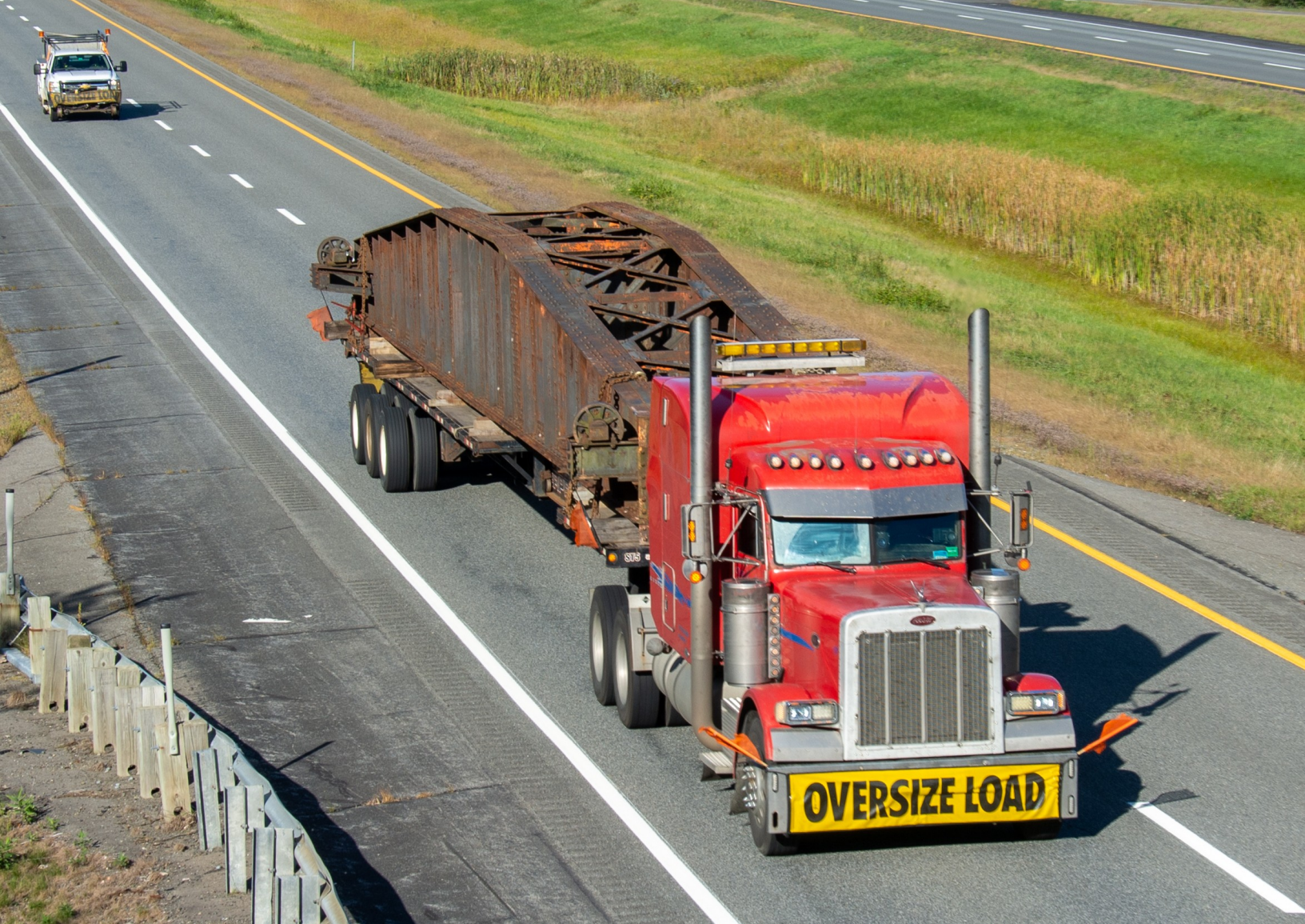
Above: The fastest turntable in the state! Rolling down I-95, as shot from the Medway / Millinocket exit overpass.

It was quite a sight! It is not every day one sees a 75 foot long steel turntable rolling at highway speed down I-95.