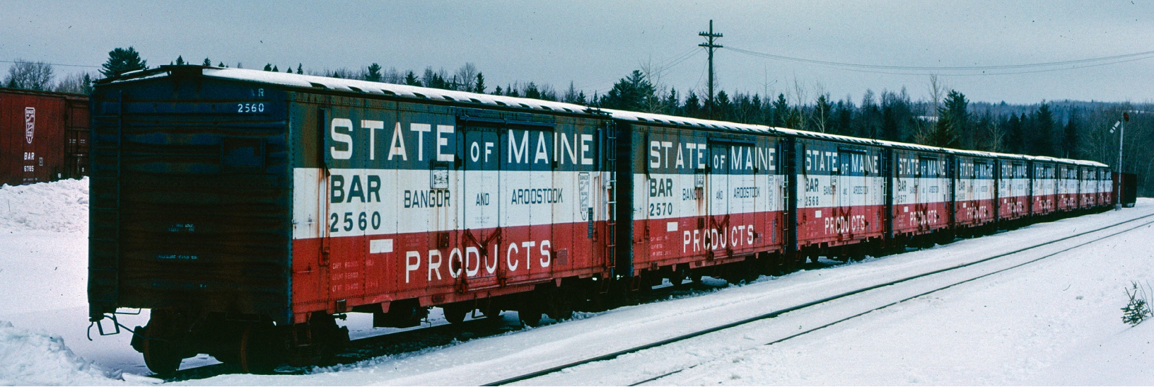
Above: 10 of the 2500 series State of Maine Products cars at Oakfield, on March 2 nd, 1979.

ice chests. Most will carry potatoes and other produce, but some will be carrying paper. What should they do? They upgraded older cars and ordered new.