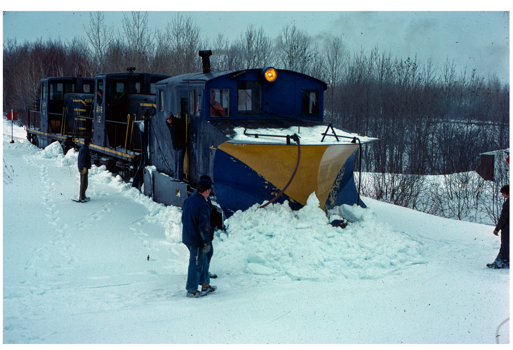
March 2, 1979 found 12 and 10 shoving the plow in Caribou.